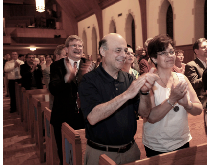
An enthusiastic audience at the North Shore Chamber Music Festival in Chicago.