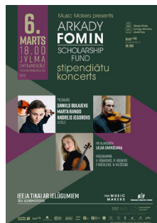
Poster from the Arkady Fomin Scholarship Fund presentation in Riga, Latvia.