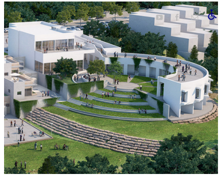
The new Keshet Eilon Music Center in Western Galilee.